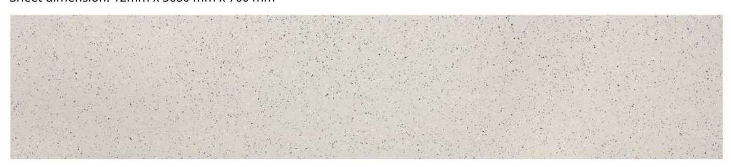
HIMACS - The Solid Surface Material by LX Hausys – lxhausys.com/eu