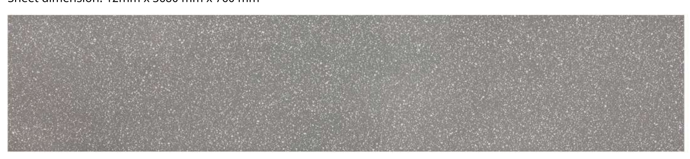
HIMACS - The Solid Surface Material by LX Hausys – lxhausys.com/eu

Sheet dimension: 12mm x 3680 mm x 760 mm